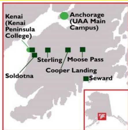
Major Southcentral Test Case locations